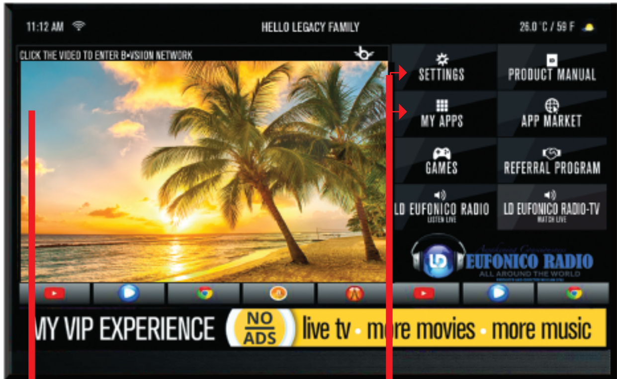
HOME SCREEN VIDEO